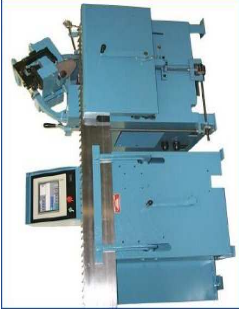
Armstrong Vari-Sharp Computer Controlled Band Saw Sharpener